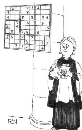
Sara preferred to let people work out the hymns for themselves